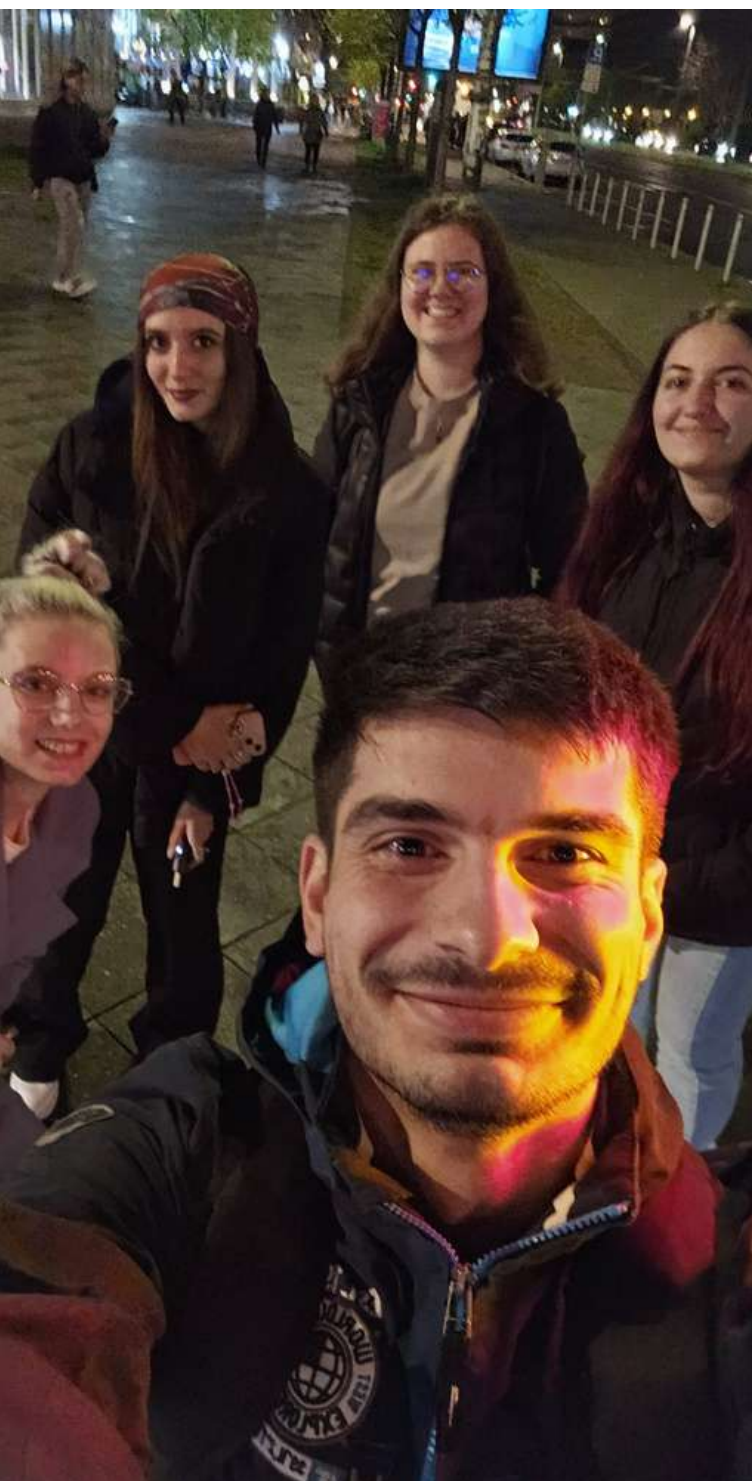
PHOTO: Students from the Bucharest University of Economic Studies participate in April 2023 in the Berlin hybrid mobility organized by ESCP Berlin campus in Erasmus+ Project FOReSiGHT 2020-1-RO01-KA203-080368 (ASE consortium lead)