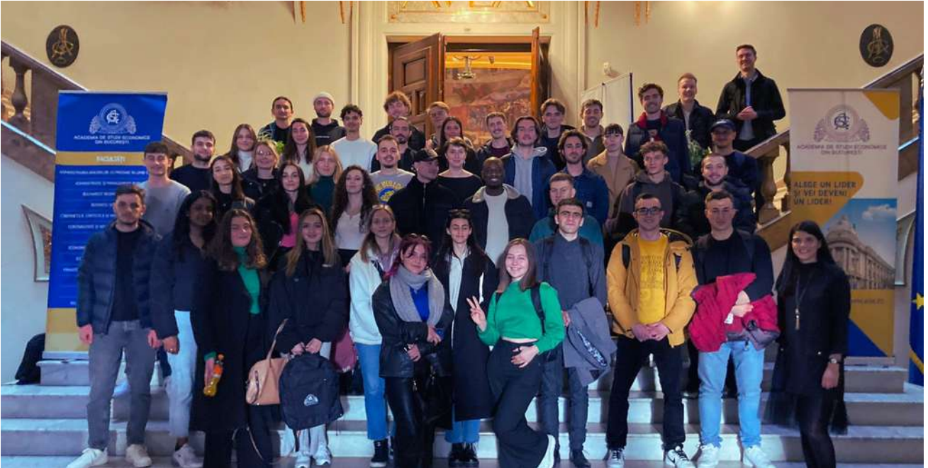
PHOTO: Welcome Day in February 2023 for our incoming Erasmus+ students studying at ASE in the spring semester

Workshop on cultural adaptation for international students