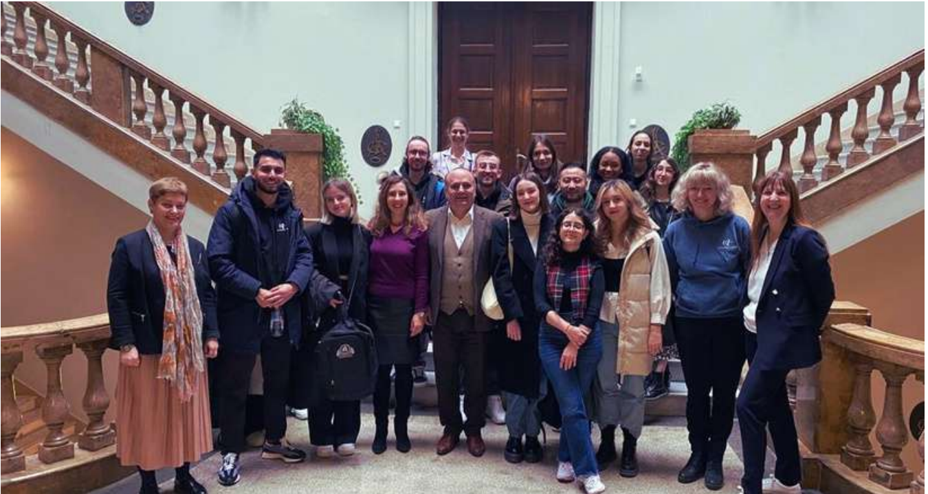
PHOTO: Welcoming in March 2023 a delegation of students and professors from our partner, the University of Artois, from France within our double degree agreement for bachelor studies with the Faculty of International Business and Economics, Applied Modern Languages.