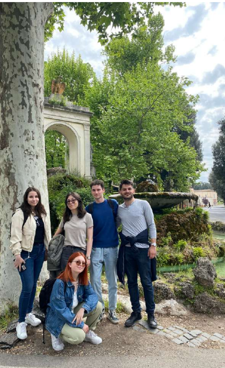
PHOTO: Students from the Bucharest University of Economic Studies participate in April 2023 in the Rome hybrid mobility organized by Sapienza University of Rome n Erasmus+ Project FOrSiGHT 2020-1-RO01-KA203-080368 (ASE consortium lead)